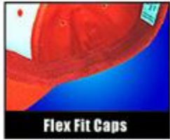
Flex Fit Caps