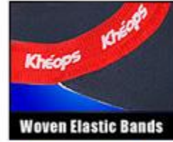
Woven Elastic Bands