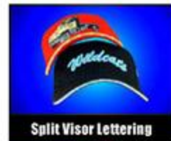
Split Visor Lettering