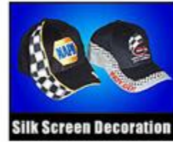
Silk Screen Decoration