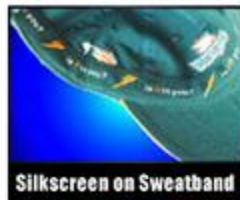
Silkscreen on Sweatband