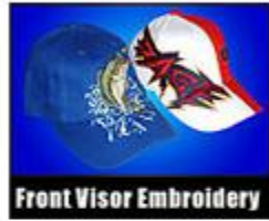
Front Visor Embroidery