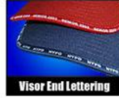
Visor End Lettering